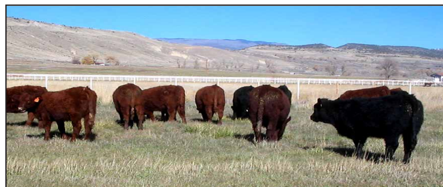
Call us for information on our replacement heifer offerings

Tuesday, December 18, 2007 * Starting at 10:00 am MST at our Bull Development Center in Eckert, CO