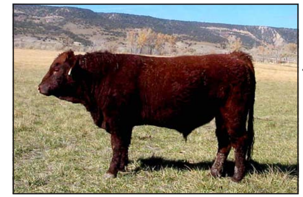
W-751S -A polled thick percentage bull with great carcass numbers