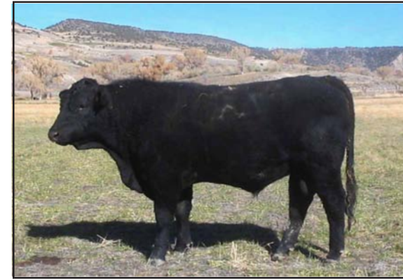
G468S -A Black Angus Optimizer bull with super growth and performance

The Figure 4 Cowherd was honored with 5-GOLD ELITE DAMS and 22 SILVER ELITE DAMS representing 12% of all the GOLD AND SILVER DAMS in the Salers Breed.