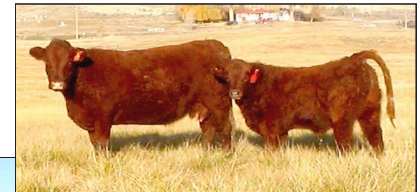
Above A Percentage Pair With Lots of Meat and Volume