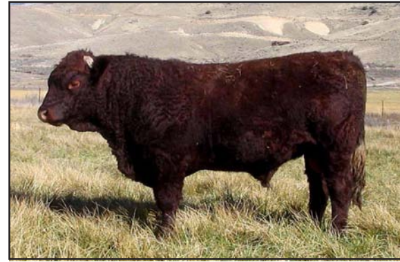
O-028S -A moderate fullblood bull with low birth weight numbers