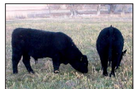
We have selected for long bodied, deep volume, good disposition cattle for years.