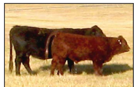
The bulls we are offering all weighed from 600 lbs to 800lbs in late October.