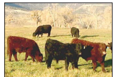
A consistent set of black and red, 7/8 and purebred bulls.