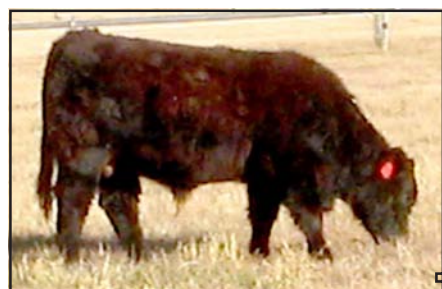
R-312T Mr. Meat Master An Aubrac Composite